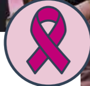
Getting ready for a mammogram in the new outpatient clinic

WHICH IS SUBSTANTIALLY LOWER THAN AMONG PATIENTS IN ISRAEL.