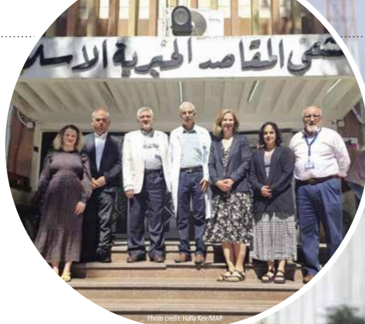
Olivia Blake MP, Bambos Charalambous MP, Anna McMorris MP and Nadia Whittome MP outside Al Makassed Hospital in East Jerusalem.

In June 2022, people in Gaza marked 15 years under Israel's suffocating, illegal blockade and closure. In partnership with Al Mezan Center for Human Rights, MAP published a report warning that Israel's collective punishment of Gaza has created a humanitarian and health crisis that continues to deteriorate year-on-year. We highlighted how stifling restrictions and repeated military attacks have degraded Gaza's healthcare system and routinely prevented patients from accessing essential and potentially life-saving care.