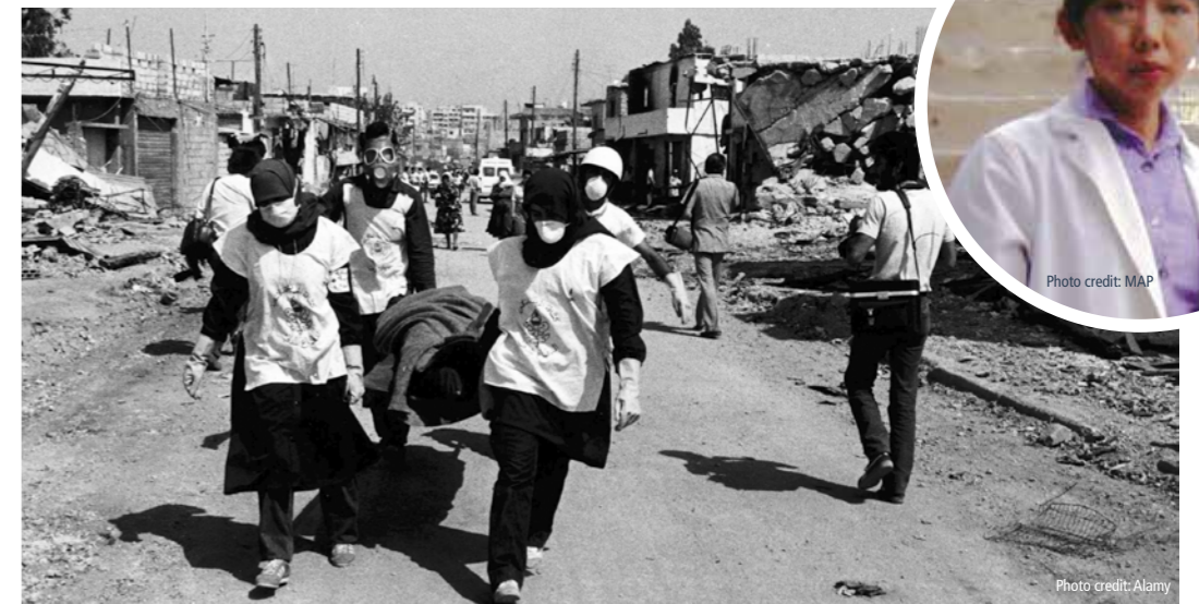
United Nations relief at Shatila refugee camp, 1982