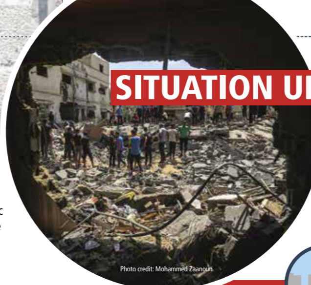
Palestinians inspect damage caused by an Israeli airstrike on a building in Sheikh Acleyn neighbourhood in Gaza.