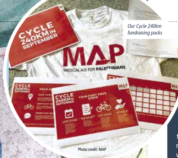
Our Cycle 240km fundraising packs